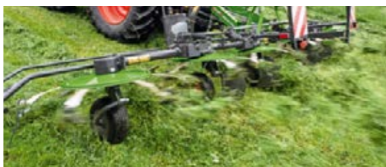
The anti-wrapping system prevents the crop from wrapping itself around the wheel axle.