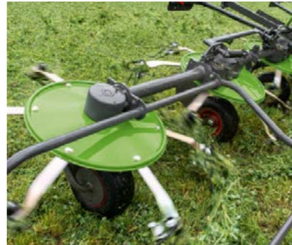
Voluminous tyres on every rotor for excellent feed intake and ground adjustment.