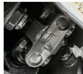
The maintenance-free double-cross joints ensure direct power transfer and means the tedder can turn even in the folded transport position.