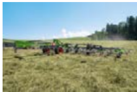
Attached Lotus models stand for both maximum impact and outstanding feed protection.