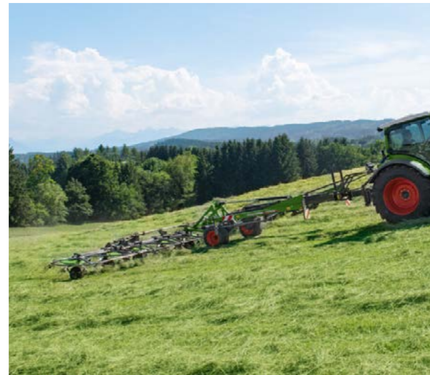
Spread over the working width, there are several swivel joints between the rotors that make sure each one individually adapts to the ground. Low wear and clean feed, guaranteed.