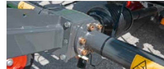
The overload protection on the main drive joint shaft increases operational reliability and makes the Lotus tedder drive train exceptional durable.