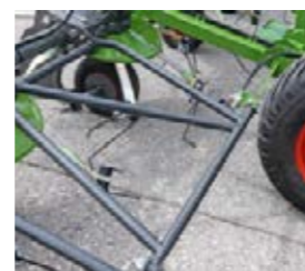
The towed tedders have an extra grid frame for maximum stability, both for protection and to reinforce the main frame across the full machine width.