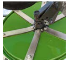
Large rotor plates mean the tine speed remains high at a low rotor speed.