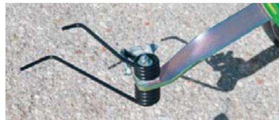
The special tine attachment with adjustable positioning angle means you can easily switch to boundary spreading or night swaths while protecting against tine loss.