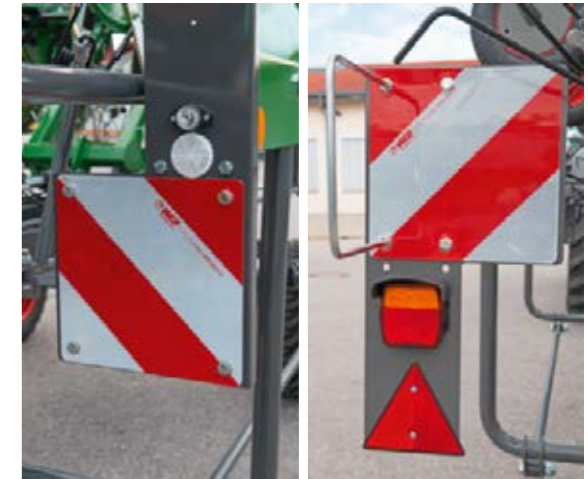
For increased road safety, attached Lotus models have extra-large warning signs and follow the main lighting actions as standard.