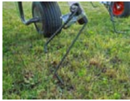
The feed is picked up with the 7.5 cm long hook on the Fendt Performance tines.