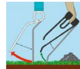
Thanks to their high flexibility, the dragging Fendt Performance tines can also avoid obstacles much more easily than conventional tines. On the Lotus, tine breakage just isn't an issue.