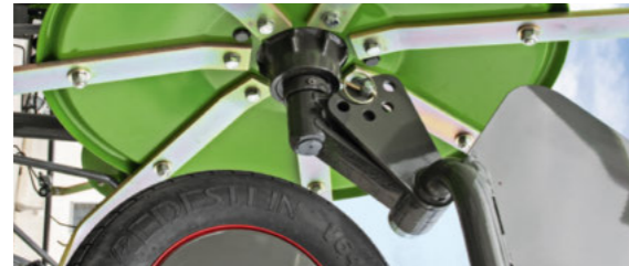
Simply move a single bolt to easily adjust the spreading angle position. You have a choice of 5 settings from 10° to 17° – precisely adapted to your needs, every time.