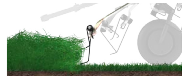
The extra stable tine arms are designed for high power transmission and maximum durability.